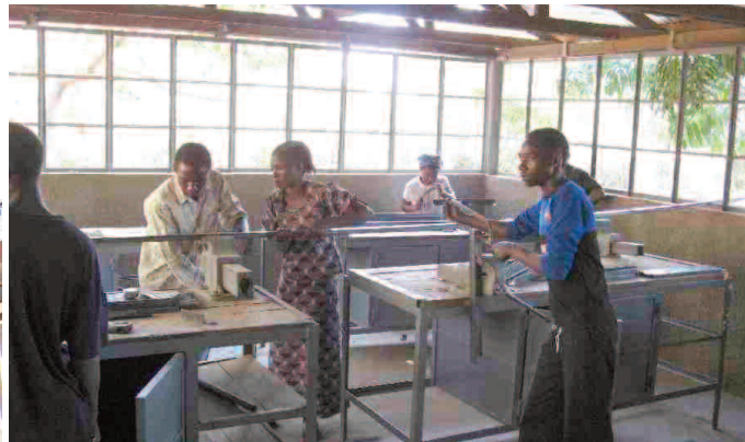
School workshops need quality tools. School libraries need good books