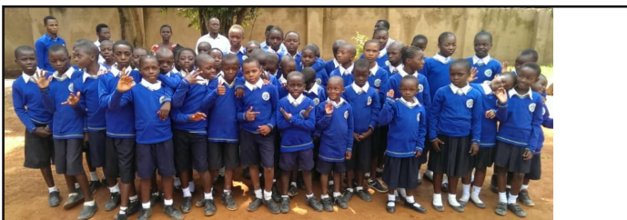
Myrt School elementary students thank Able & Willing and friends for their support.

The school year 2018 - 2019 started as usual with students enrolling slowly but steadily. At the peak of the year we had 660 students and