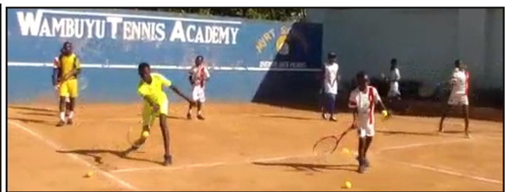
Group practice for a tournament.