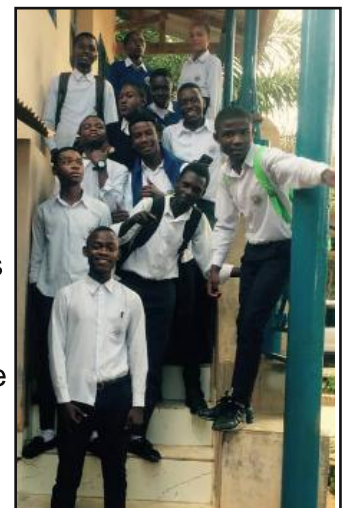
Seniors passed the national exams

Exams at the twelfth grade level are given according to the student's major area of study: electrical, mechanical, pedagogy and sewing. We had 28 students in the first three areas and 26 passed the exams. Unfortunately, none of the five sewing majors passed the exams. This is typical as these students are more interested in learning the trade than learning subjects like math and languages. Altogether, our twelfth grade students are among the top ten schools in the area.