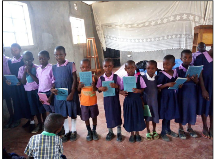
These are the children that would benefit from the construction of the school.

Constructing a school that mainstreams children with disabilities will begin to shift the paradigm of under-representation in the educational system.