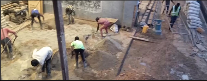
Mixing the concrete for the second floor with shovels.