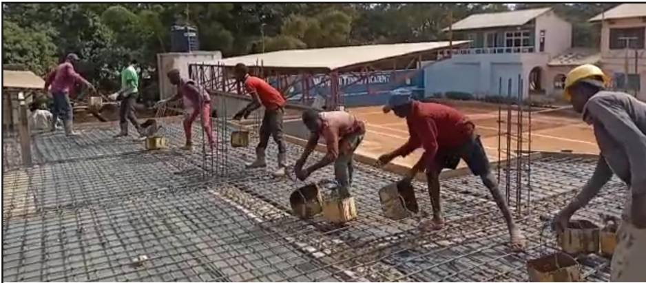
Buckets of concrete are passed up a ladder then from hand to hand.