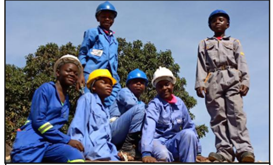
Female students in the technical school